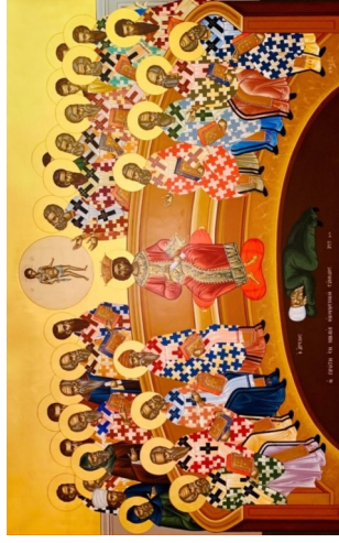
The First Ecumenical Council in Nicaea, Greek-Orthodox Metropolis in Paris