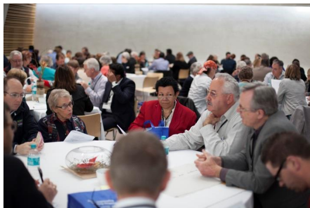
SAC?7 Conference Delegates in discussion