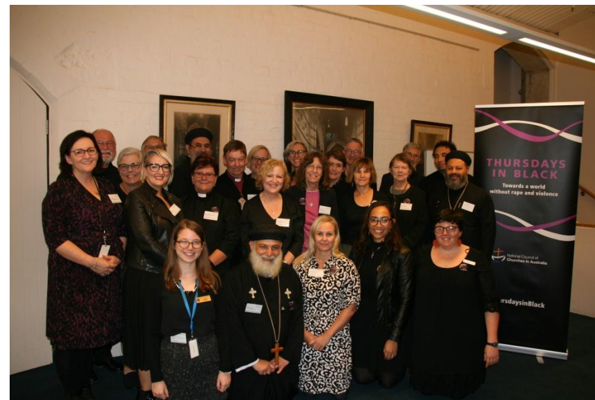
Domestic and Family Violence , May 2019