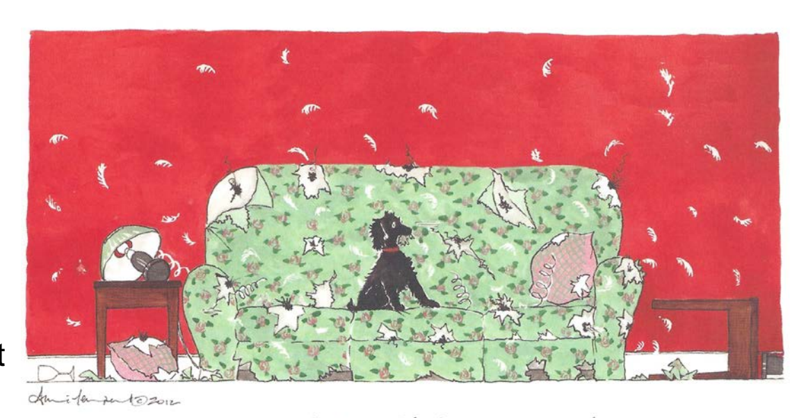
I was just sitting here when it exploded... I am just as surprised as you are...