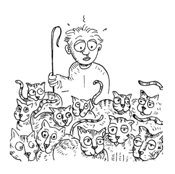
Or... Herding cats