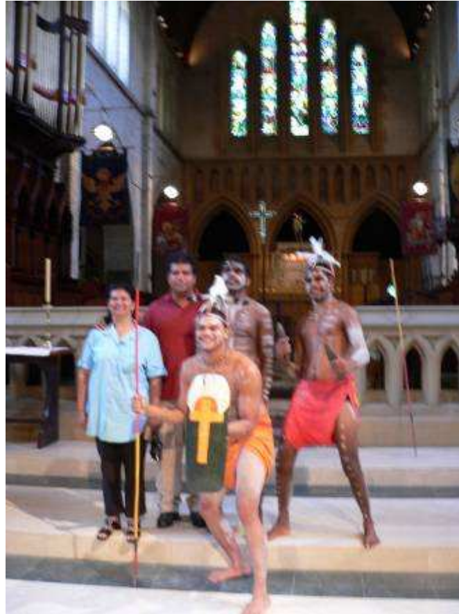
Yarrabah group