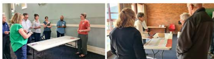
Above: Presenter training in Marrickville (L) and Grafton, NSW.

The Safe Church Program is currently looking toward the future to see where and how we can best support and serve our churches and church organisations in their safeguarding endeavours.