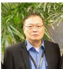
Thomas Ling Chinese Methodist Church in Australia