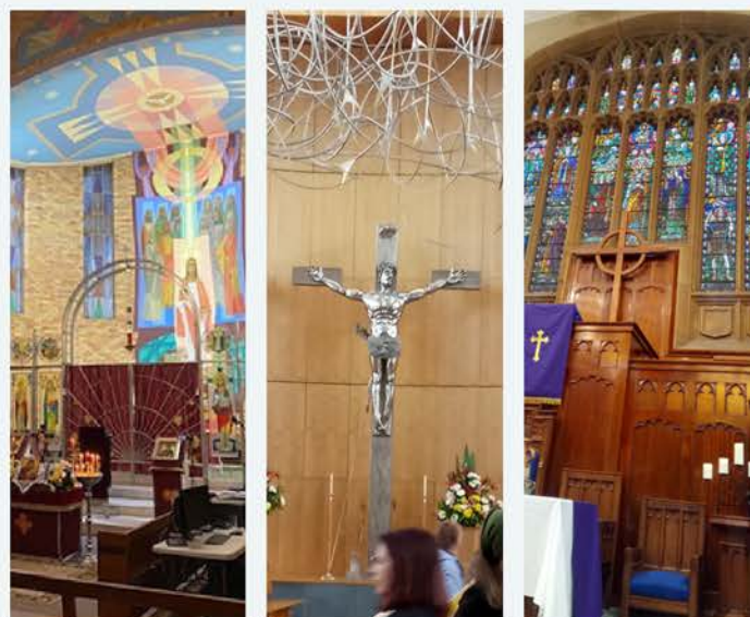
Above L-R: Ukrainian Greek Catholic Church, Lidcombe; St Patrick's Cathedral, Parramatta; St Stephens Uniting Church, Sydney.