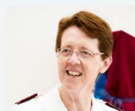
Commissioner Miriam Glyuas