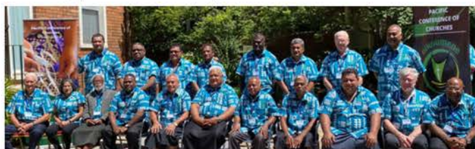
Above: Participants at the 2022 meeting held at Baulkham Hills, Sydney.

The meeting provides an opportunity to celebrate the shared journey of faith and life of Pacific churches as an ecumenical body of Christ. All members of the Pacific Conference of Churches (PCC) are encouraged to participate, along with other denominations who may be invited to attend opening sessions, information sessions, worship, and fellowship.