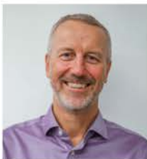
Rob Floyd Uniting Church in Australia