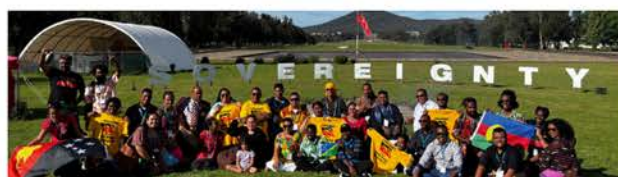
Above: Participants at the Pacific Australian Emerging Leaders Summit (PAELS), on Parliament lawn, Canberra, November 2022.

The Summit is a long-term investment in relationships.