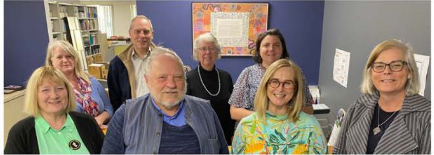
Above: AEON members meet in Sydney,