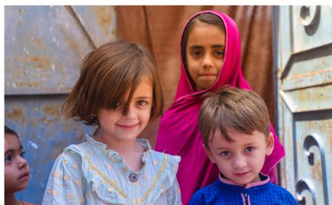
Above: Act for Peace's partner in Pakistan, CWSA, is supporting families from Afghanistan who are seeking refuge in Pakistan with cash assistance for immediate food security and other essentials.