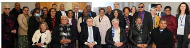
Above: Network participants at the 2022 meeting held in Canberra.

The Network's meetings serve to enhance and establish strategic partnerships between Australian church leaders, church-based development leaders, and First Nations people and members of the Pacific diaspora in Australia.