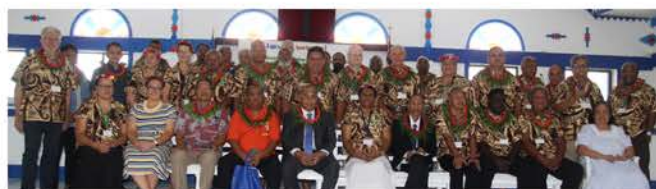
Above: Representatives from member churches following the opening service, held in Majuro, Marshall Islands.

Representatives attended from member churches and organisations in Fiji, Samoa, American Samoa, Tuvalu, Kiribati, Cook Islands, Vanuatu, Solomon Islands, Marshall Islands, Federated States of Micronesia, West Papua, Australia, New Caledonia, Nauru and Maohi Nui.