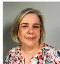
Anne Hywood Anglican Church of Australia