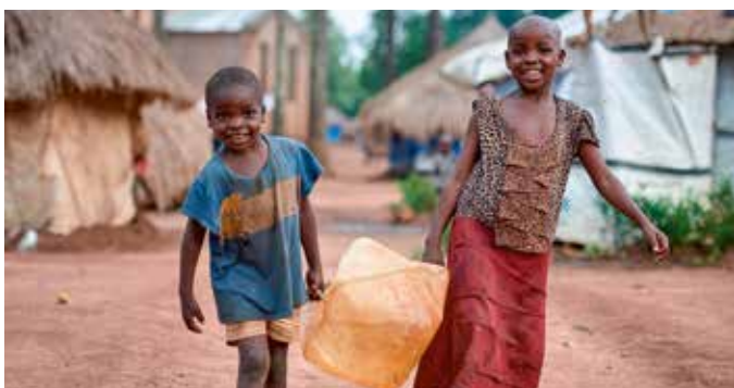
Children carry water home in a camp for internally displaced persons in South Sudan, supported by partner Norwegian Church Aid through the Christmas Bowl 2019.

Act for Peace paused progress towards our next strategic plan in light of the pandemic and so created space for staff to respond to the changing situation facing our partners. Future planning also now responds to the long-term global disruption caused by the pandemic.