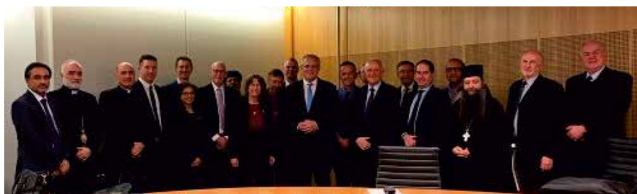
Above: Faith leaders with the Prime Minister, Scott Morrison, 5 August 2019